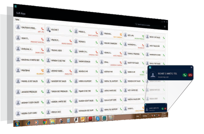
DSS, BLF & POP-UP NOTIFICATION